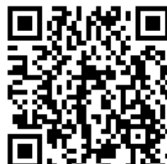
2019-1 4 級 part2