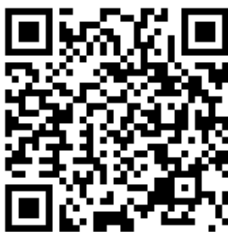
2019-1 4 級 part1

iPhone のカメラで読み取るかや Android 対応機種では QR コードリーダーアプリを Google Play からダウンロードできます。